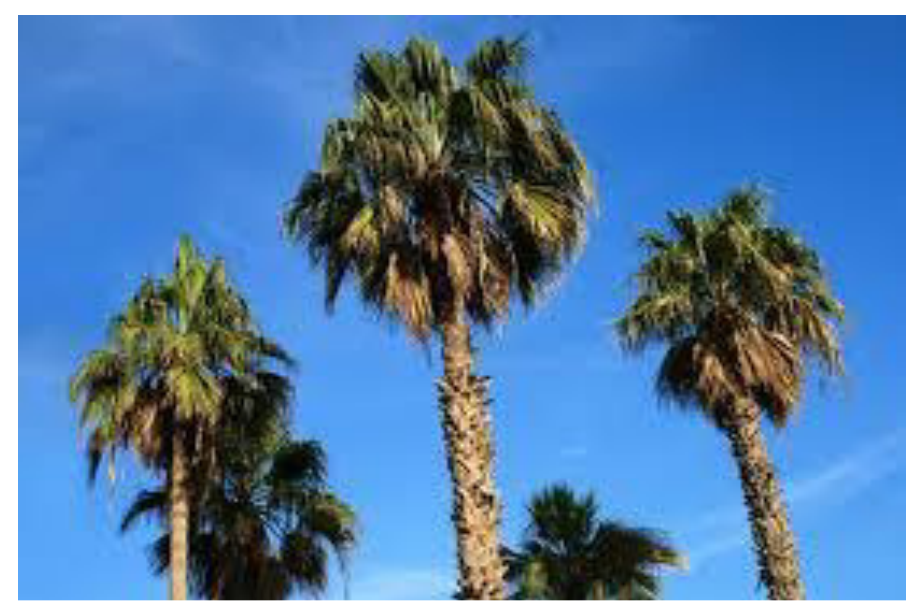
Photograph of Washingtonian Palms with lower rings of fronds browning out and drooping creating the "Hula Skirt" appearance.

Rules will advise homeowners of Washingtonian Palm trees requiring trimming when the lower ring of fronds brown out and droop, creating a hula skirt appearance. The ACC recommends trimming Washingtonian Palms to the 9:00-3:00 o'clock position. (The Photograph below illustrates when Washingtonian Palms are beyond the point where trimming is required. A properly 9:00-3:00 o'clock position Washingtonian trim should be similar to the illustration in the preceding paragraph).